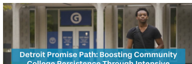
Detroit Promise Path: Boosting Community College Persistence Through Intensive Coaching and Free Tuition