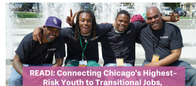
READ!: Connecting Chicago's Highest-Risk Youth to Transitional Jobs, Support Services, and Cognitive Behavioral Therapy