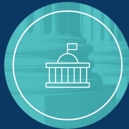
Standards of Excellence