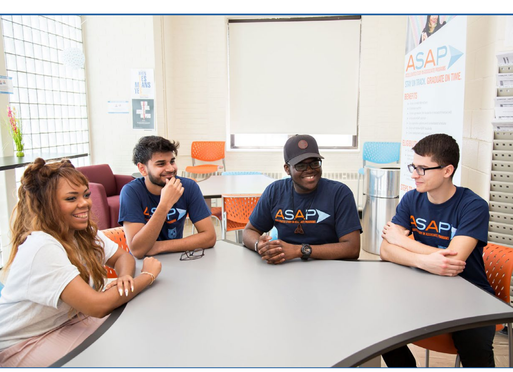
New York City College of Technology students meet with their CUNY ASAP peers.