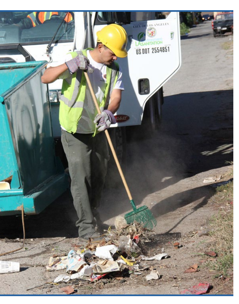
A Los Angeles sanitation worker cleans up a city street.

• Help Residents Engage: Los Angeles posts all CleanStat data online for the public's review and use. The City also gives residents opportunities to prevent litter and address street and alley cleanliness through community clean-up challenges that include awards and recognition prizes. The City's 311 service request line is also widely promoted as an easy way for residents to call in litter and illegal dumping clean-up requests. These efforts empower residents to take an active role in addressing neighborhood cleanliness.