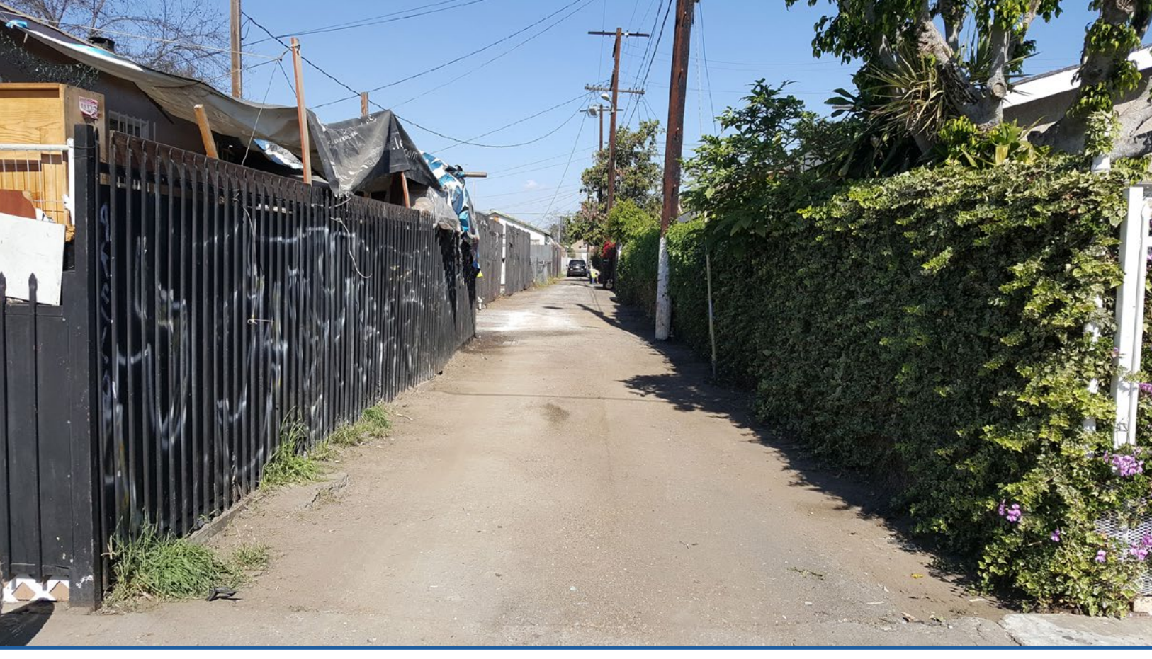
After: Alley clean-up in Central Alameda neighborhood.