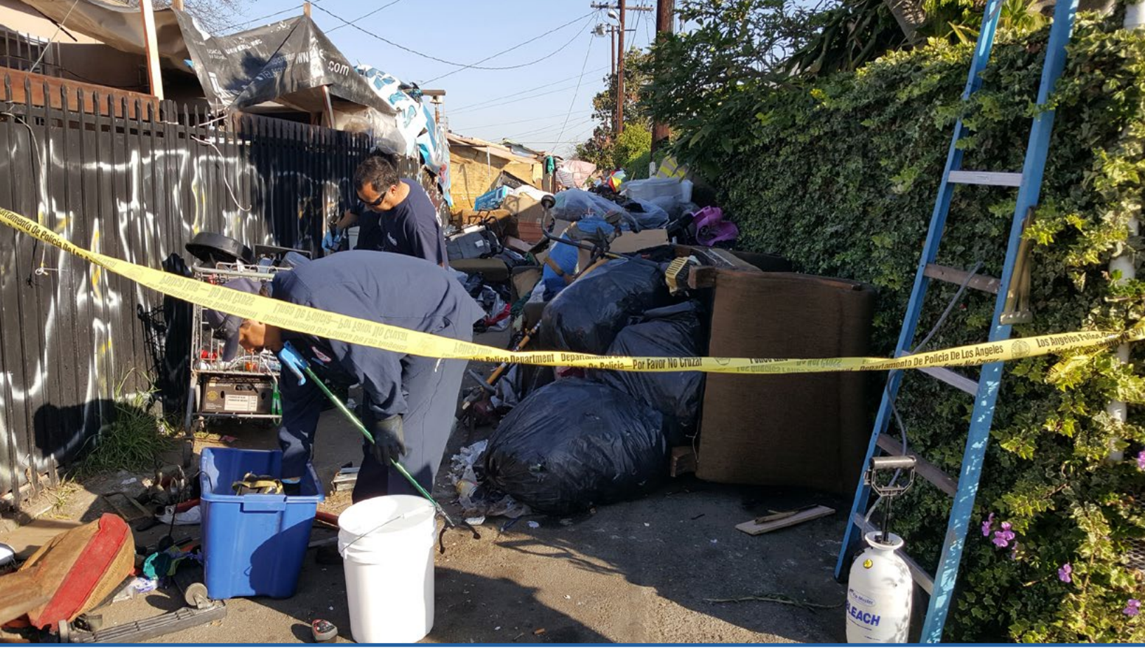
Before: Alley clean-up in Central Alameda neighborhood.