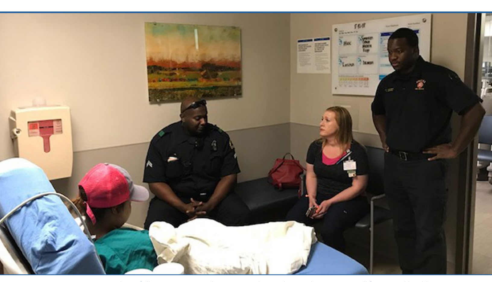
RIGHT Care Team conducts follow up care to a client serviced a week prior during a 911 call for mental health crisis.